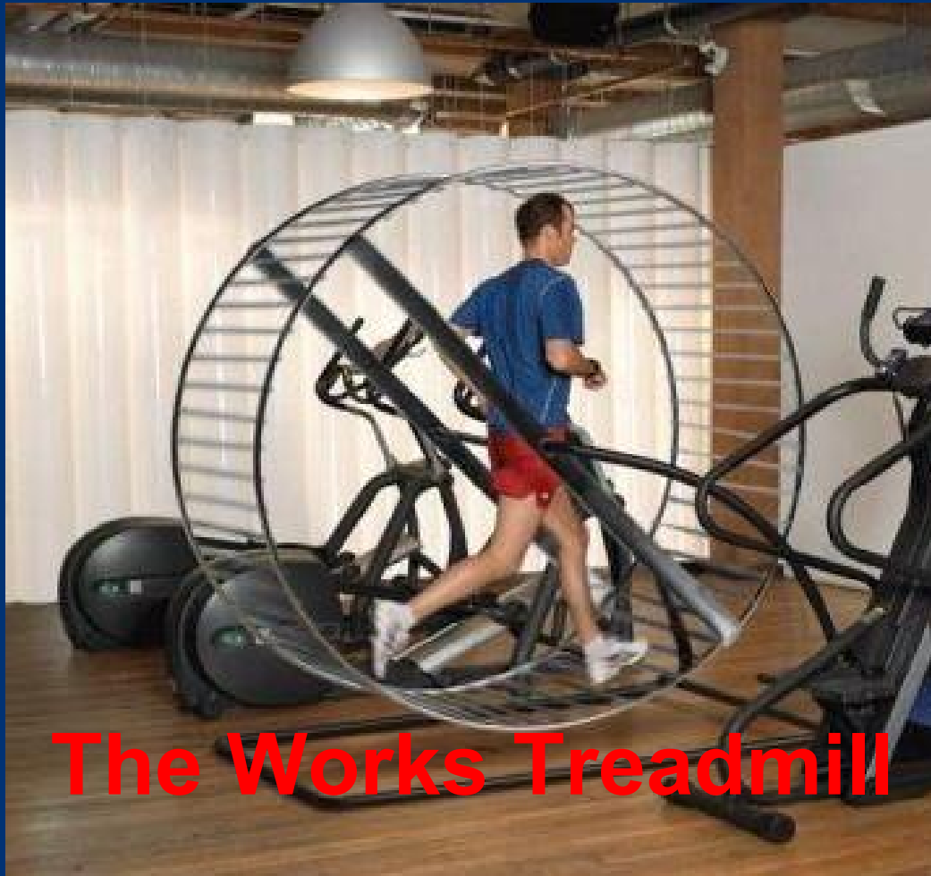
The Works Treadmill